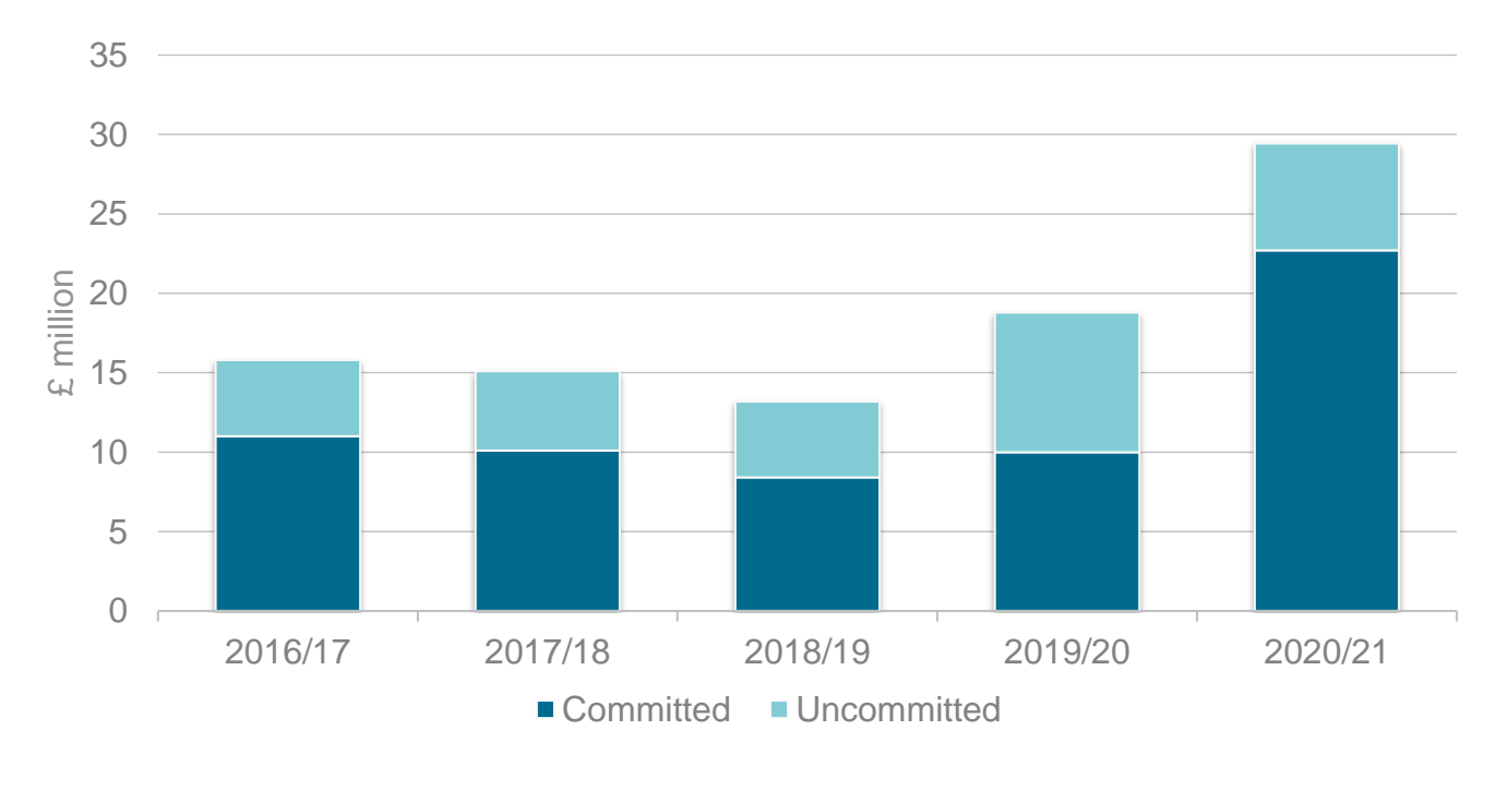
Exhibit 4 Analysis of general fund balance